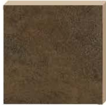
Stone Gabro Brown