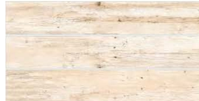
Berkah Wood Sandal