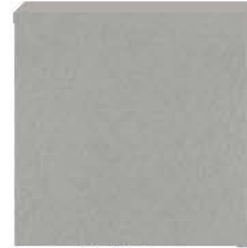
Simento Graffiti Gray