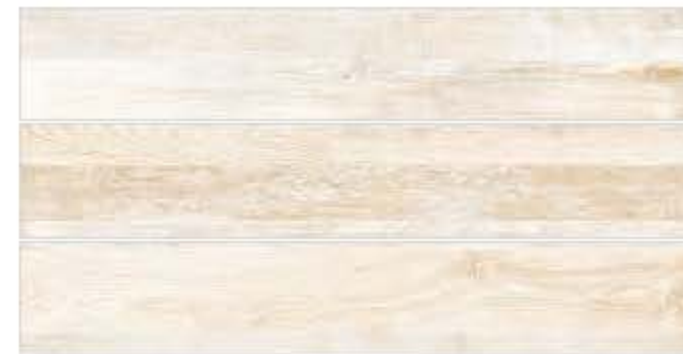
Palm Wood Sandal