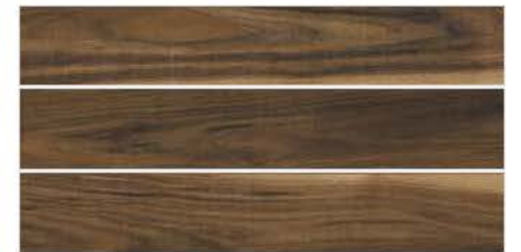
Shorea Wood Brown