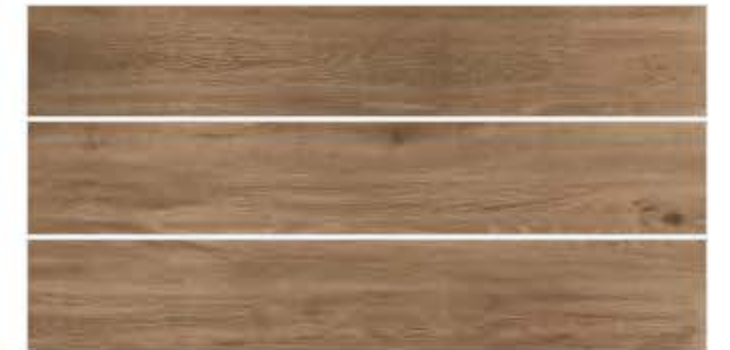
Siri Wood Brown