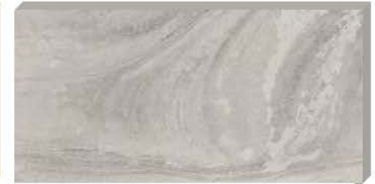
Horny Smoke Gray