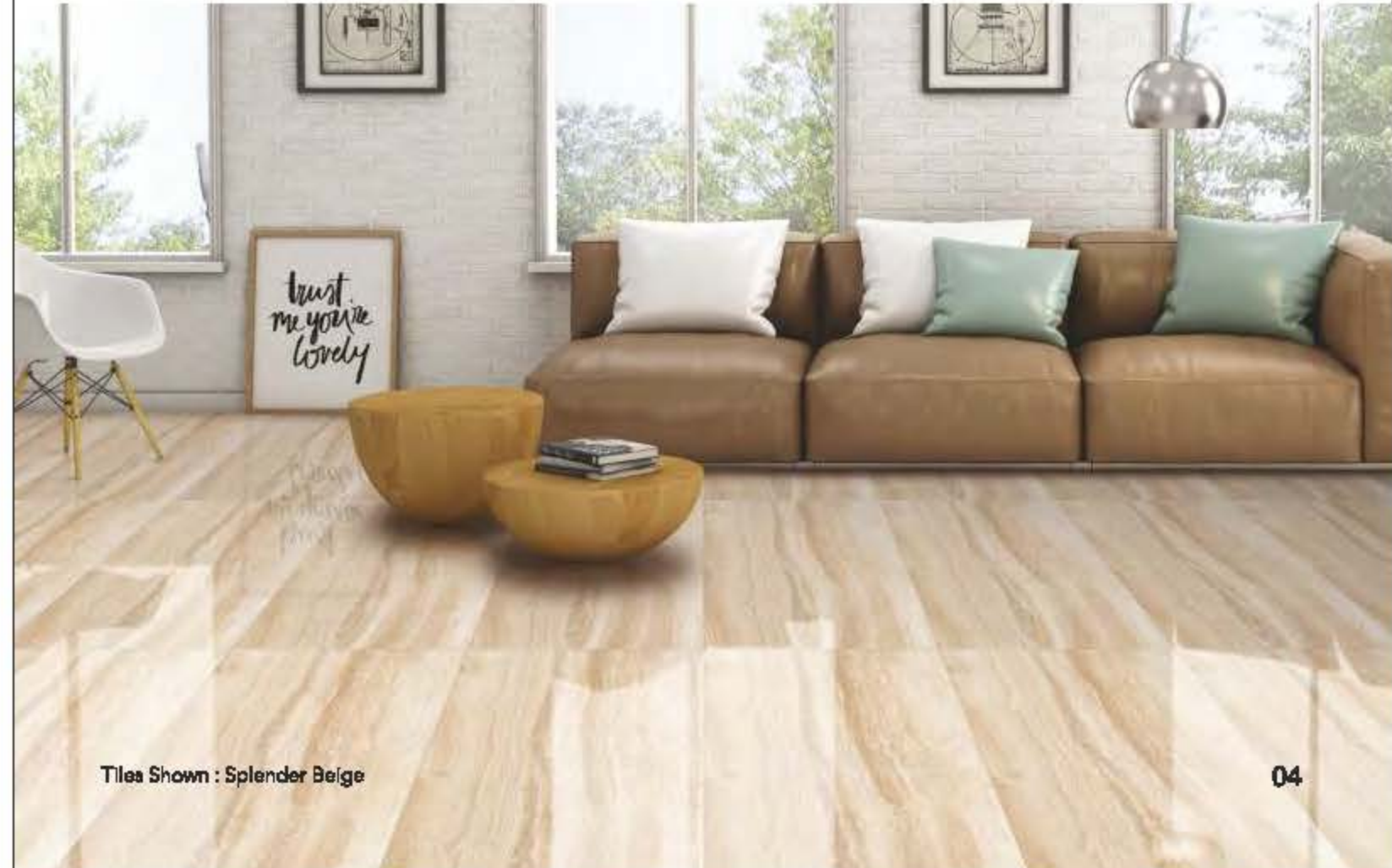
Tiles Shown : Splendor Beige