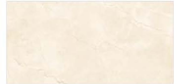
Swiss Marfil Crema