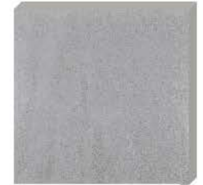
Stone Citrine Gray