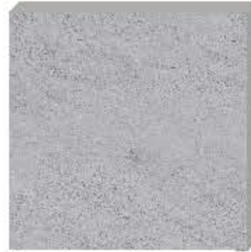
Stone Gypsum Gray