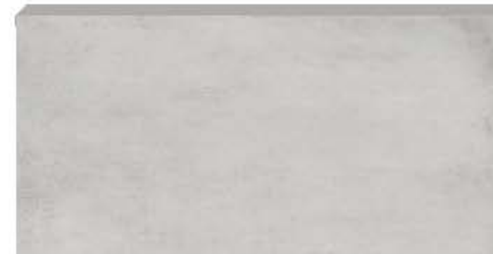
Grave Smoke Gray