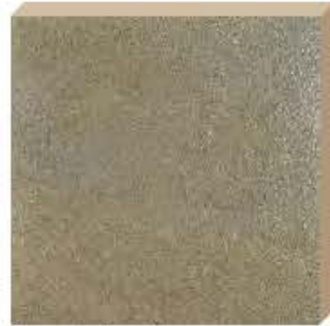
Stone Gabro Crema