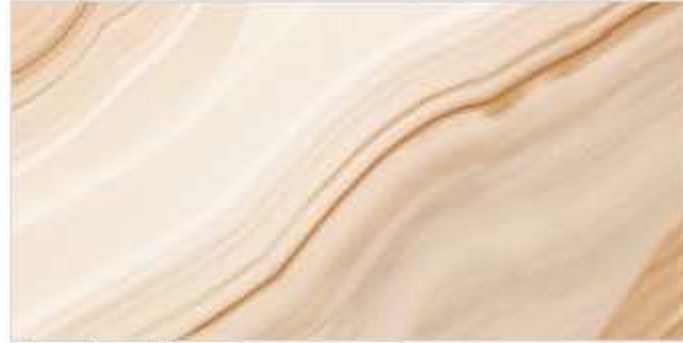
Aqua Onyx A/B