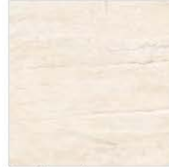
Royal Diana Crema