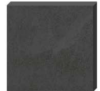
Stone Granet Black