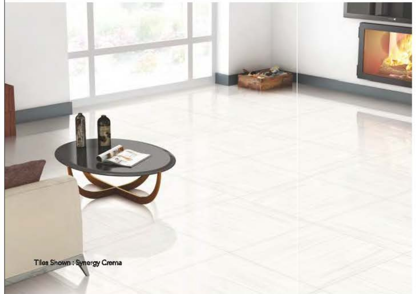
Tiles Shown : Synergy Crema