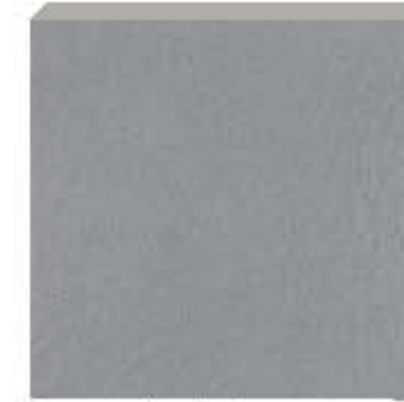
Simento Sandy Gray