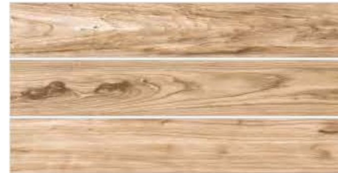
Sundari Wood Brown