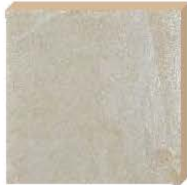
Stone Texas Crema