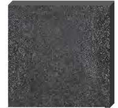
Stone Miraj Black