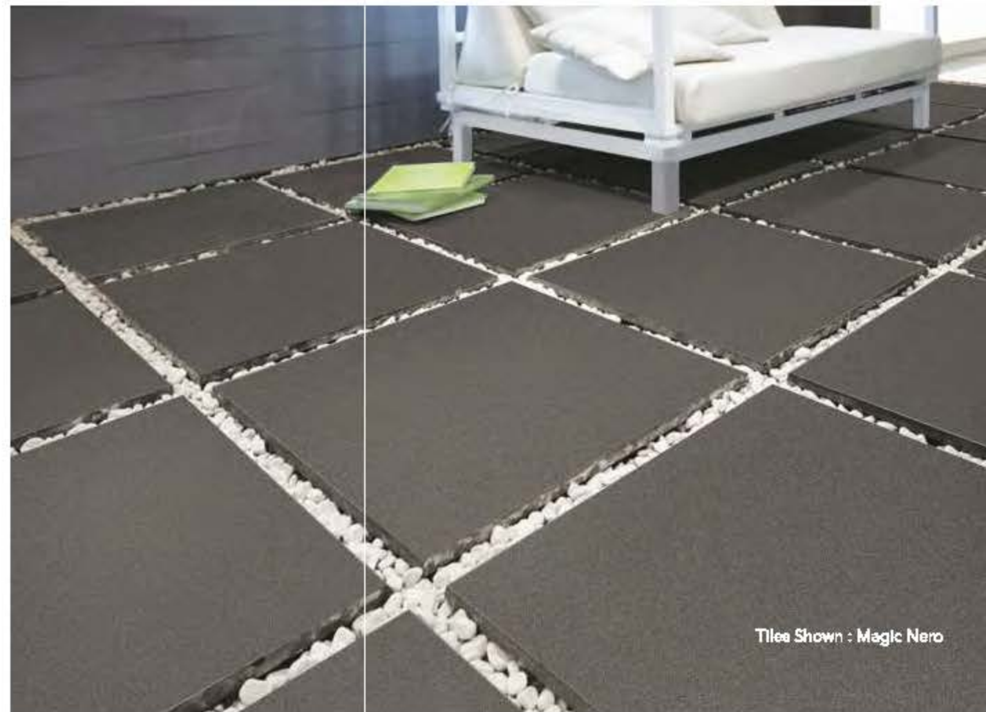
Tile Shown : Magic Nero